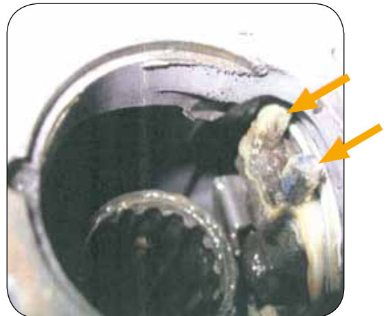
4. Brake the 2 pins loose.