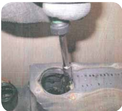
5. Fill up bushing with grease to pick the Pins and remove Pin 1.