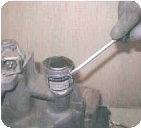
Detach Typ Plate.