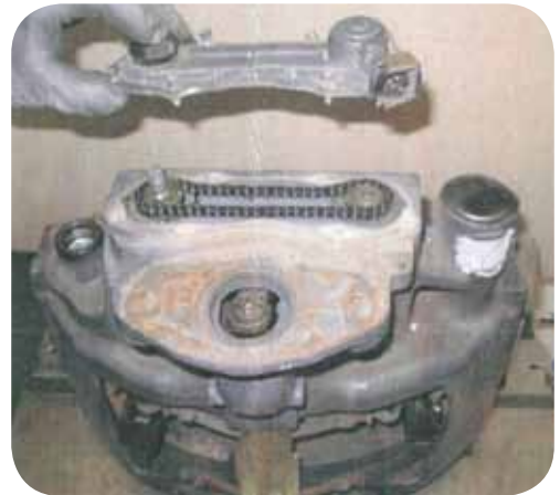
2. Remove Cover Plate and chain.