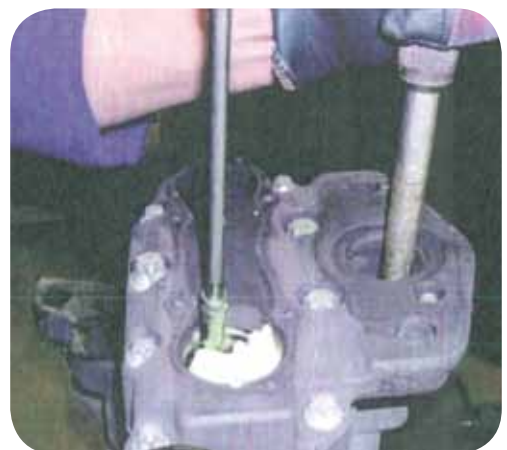
6. Remove Pin 2. For easier removal activate rocker arm.