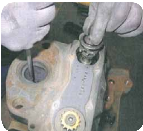
3. Remove adjuster. For easier removal please activate rocker arm.