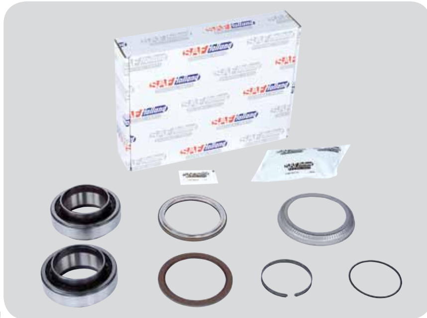
Fig. with exciter ring