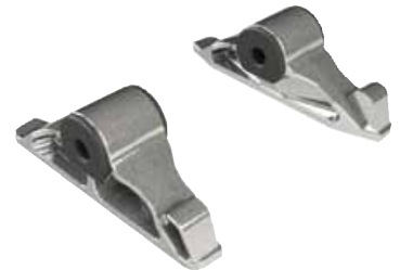
RK-X700 RH & LH Brackets