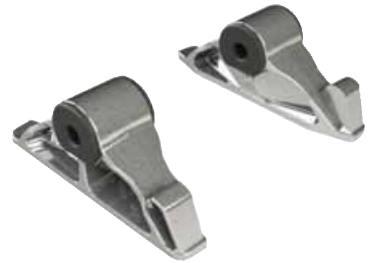
RK-X800 RH & LH Brackets