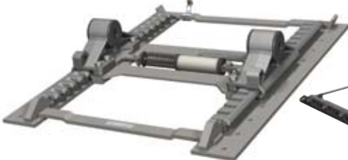
Integrated Light Weight Slider System (ILS)

FOR OPERATIONS WHICH MAY REQUIRE FREQUENT ADJUSTMENT.