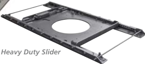
Heavy Duty Slider