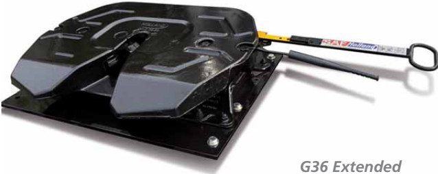
G36 Extended Handle