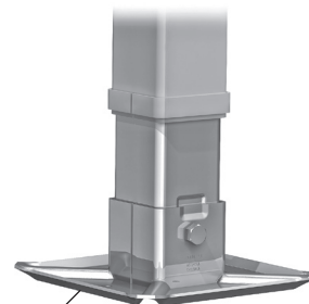
Removable Cushion Foot Option Code 24