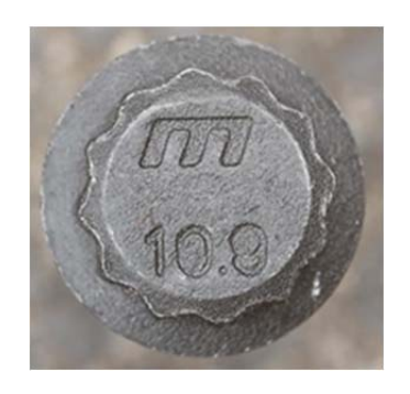
replica bolt with lower grade 10.9

Tel. +49 6095 301-301 · originalparts@safholland.de · 2014-02-15 · XL-SA10068WI-de-DE Rev C · Page 2 from 3