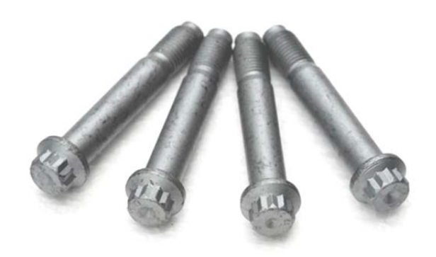
Original SAF-HOLLAND double hex bolts