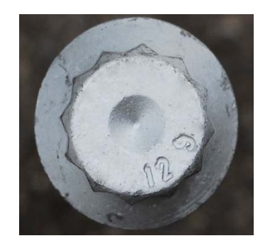
Original SAF-HOLLAND bolt grade 12.9

It has been found that the replica hub assemblies are providing a silver coloured bolt to a low grade of 10.9.