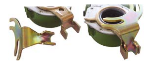
Fig. 4: Haldex slack adjuster

Tel. +49 6095 301-0 · info@safholland.de · 2014-10-24 · XL-SA10071WI-en-DE Rev A