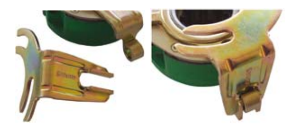
Fig. 3: SAF slack adjuster