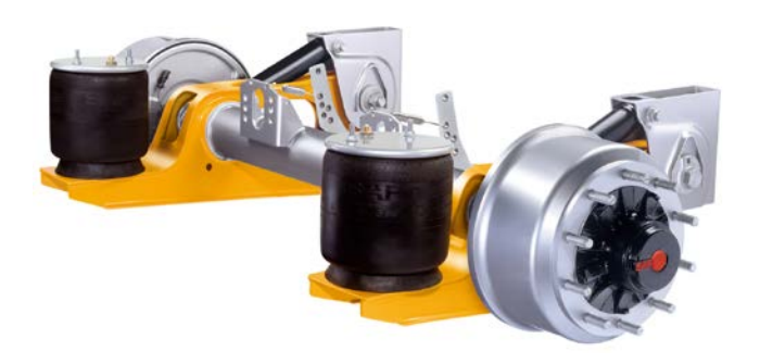
Fig. 1: SAF INTRADRUM

From February 2015, it will be fitted as standard on drum brake SNK 420x180.