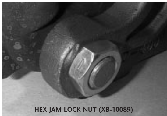
FIGURE 2 Change is necessary

If your coupler has a draft hook retaining nut that looks like the nut shown in FIGURE 2 , your coupler IS subject to this recall and you MUST replace the nut according to the procedure outlined in this service bulletin.