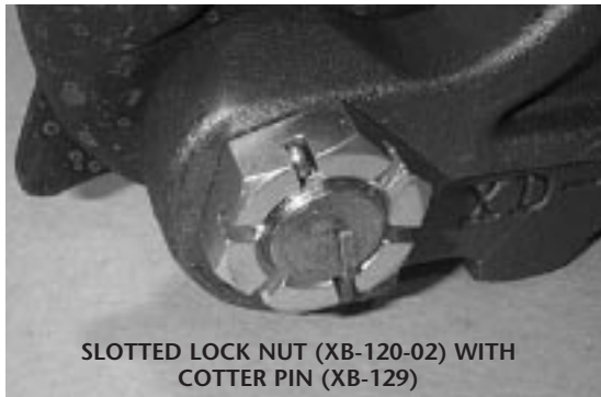
FIGURE 1 No change necessary

If your coupler has a draft hook retaining nut that looks like the nut shown in FIGURE 2 , your coupler IS subject to this recall and you MUST replace the nut according to the procedure outlined in this service bulletin.